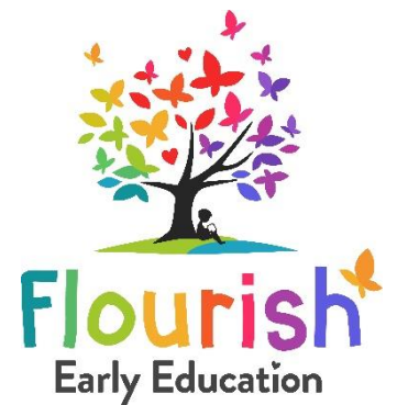
Flourish Early Education